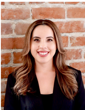
City of Houston Abigail Gonzalez Position 4